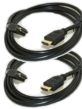
2 x HDMI Cables