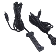
External IR Receiver and IR Emitter